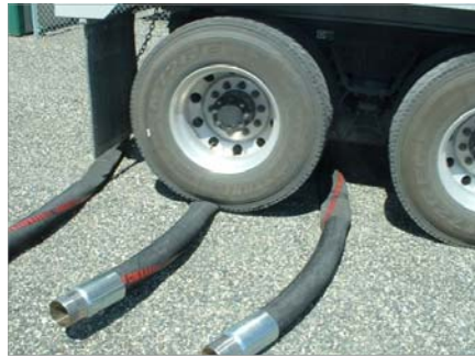
Vehicle Crush Test