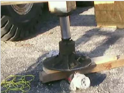
Crane Outrigger Crush Test